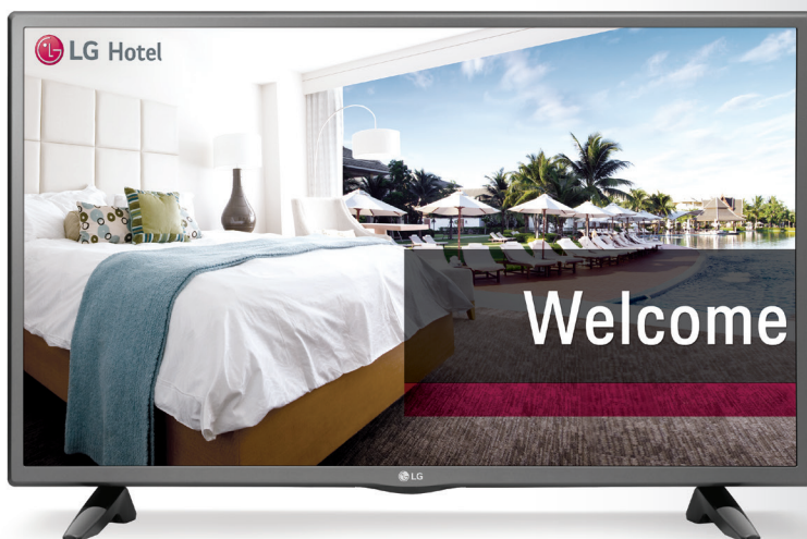
LX300C : 32"

LG Commercial Lite TVs are designed specifically for hospitality and business environments. With the use of simple user-friendly interfaces and superb images and video, LX300C model creates a more hospitable welcome for guests and customers.